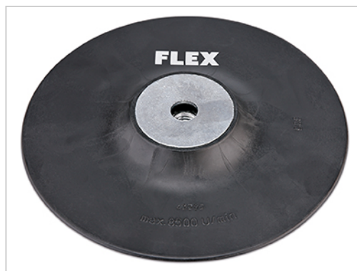
Backing pads for 180 mm fiber grinding discs.