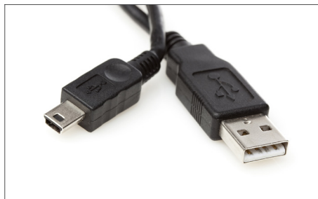
Safescan USB update cable Art. no: 112-0459