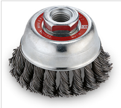
Knot-type, mount M 14