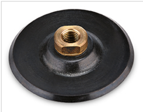
For secure attachment of the velcro diamond discs. M 14 connection.