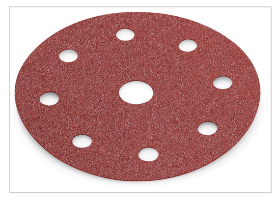
Ideally suited for working wood and metal.