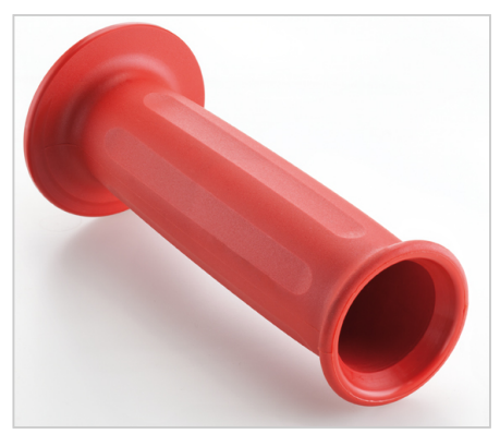
Side handle, thread M 8.