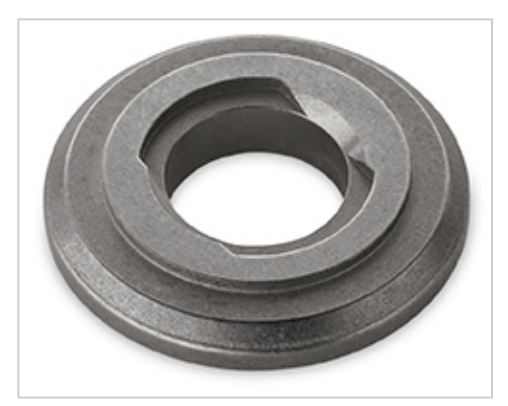
For use with flap sanding discs \emptyset 125 mm.